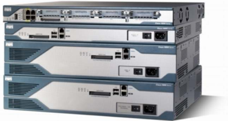
Figure 1. Cisco 2800 Series

Cisco Systems ® , Inc. is redefining best-in-class enterprise and small- to- midsize business routing with a new line of integrated services routers that are optimized for the secure, wire-speed delivery of concurrent data, voice, video, and wireless services. Founded on 20 years of leadership and innovation, the Cisco ® 2800 Series of integrated services routers (refer to Figure 1) intelligently embed data, security, voice, and wireless services into a single, resilient system for fast, scalable delivery of mission-critical business applications. The unique integrated systems architecture of the Cisco 2800 Series delivers maximum business agility and investment protection.